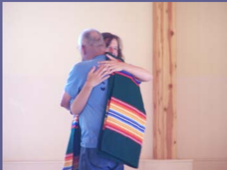
Survivor Panel Guests